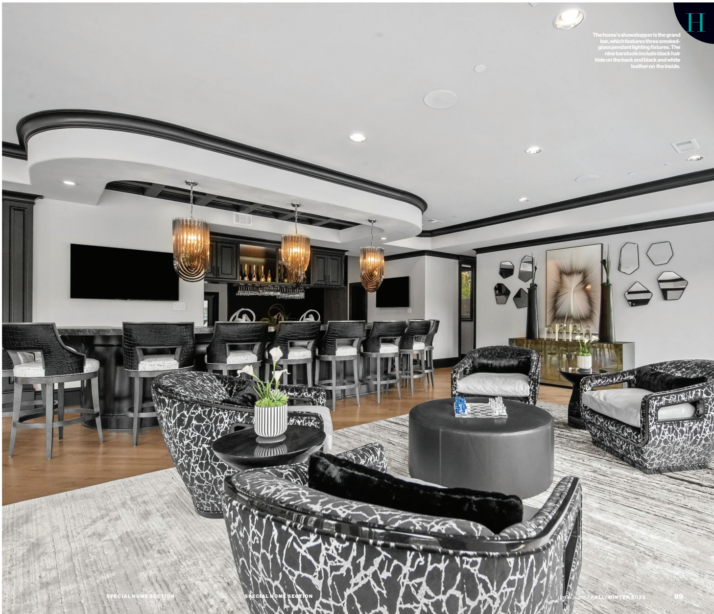
The home's showstopper is the grand bar, which features three smoked-glass pendant lighting fixtures. The nine barstools include black hair hide on the back and black and white leather on the inside.