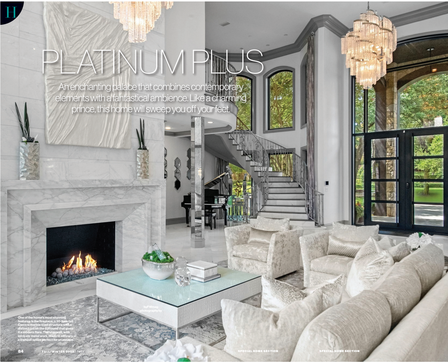
One of the home's most stunning features is the fireplace, a 20-foot-tall Carrara marble-clad structure with a distinct cut on the surround that gives it a modern flare. The stairwell, with intricate metal work, leads to a library — a tranquil space perfect for an escape.

An enchanting palace that combines contemporary elements with a fantastical ambience. Like a charming prince, this home will sweep you off your feet.