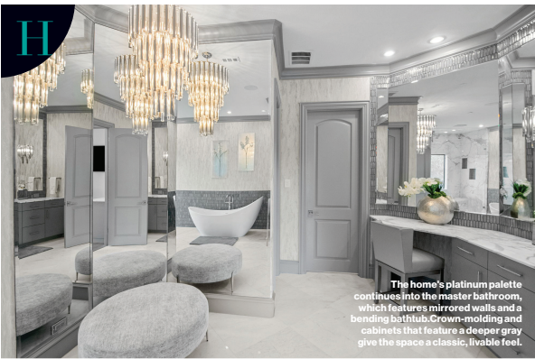
The home's platinum palette continues into the master bathroom, which features mirrored walls and a bending bathtub. Crown-molding and cabinets that feature a deeper gray give the space a classic, livable feel.