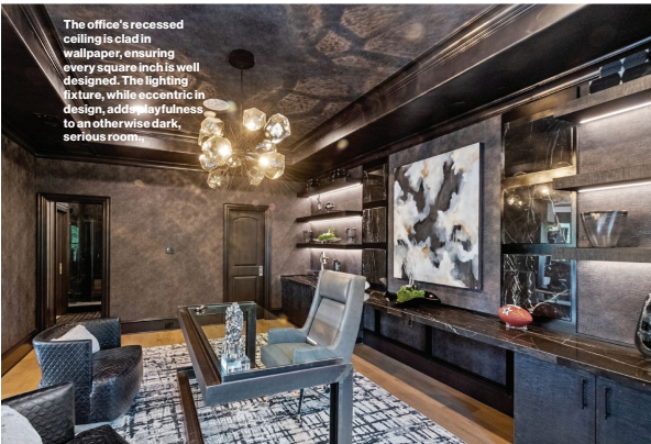
The office's recessed ceiling is clad in wallpaper, ensuring every square inch is well designed. The lighting fixture, while eccentric in design, adds playfulness to an otherwise dark, serious room.