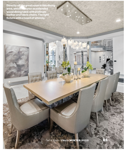
Directly off the great room is this dining area, which features an extended wood dining table with platinum leather and fabric chairs. The light fixture adds a touch of whimsy.