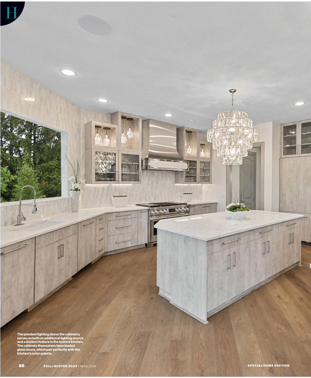
The pendant lighting above the cabinetry serves as both an additional lighting source and a distinct feature in the home's kitchen. The cabinets themselves have leaded glass doors, which pair perfectly with the kitchen's color palette.