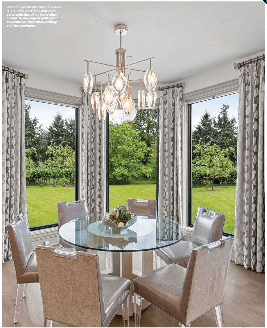
Sometimes it's best to let the outside in. This breakfast nook provides a panoramic view of the home's lush backyard, showing everything from the tennis courts to the swimming pool to a tree house.